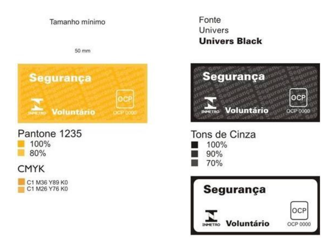
Figure 2 – Compliance Identification Mark for products with voluntary certification