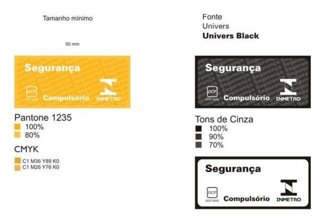
Figure 1 – Compliance Identification Mark for products with compulsory certification